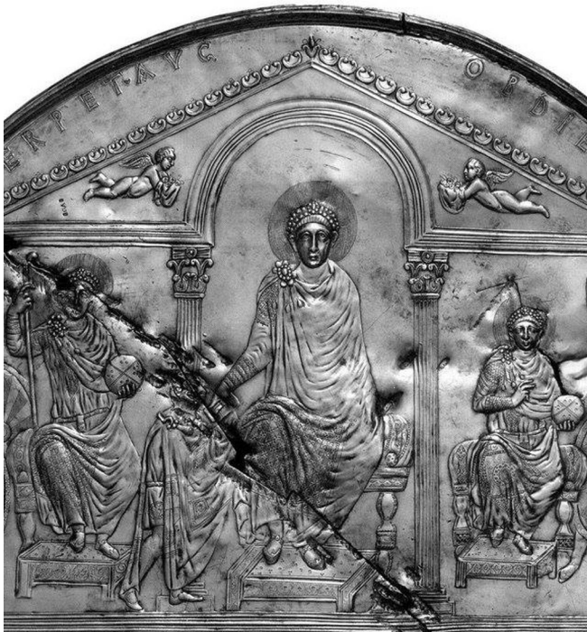
Theodosius I, Valentinian II and Arcadius. Missorium of Theodosius, detail, 388 AD, Real Academia de la Historia, Madrid.

BOUND , 24X17 cm. 360 pages. (ca. 200 illustrations mostly in Colour). 2025 , ISBN: 978-94-903871-3-6